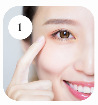
Choose the right color from our Hairwell range. You can use our color chart to help you do this.