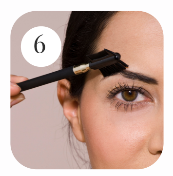
Wash the color thoroughly from the eyebrows and eyelashes with a damp cotton pad and apply a care product.

Follow the instructions for use. For professional use only. Contains phenylenediamine. This product is not intended for persons under the age of 16.